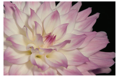
April Dawn B ID LtBld Wh/Pk 2008 Dahlia of the Year