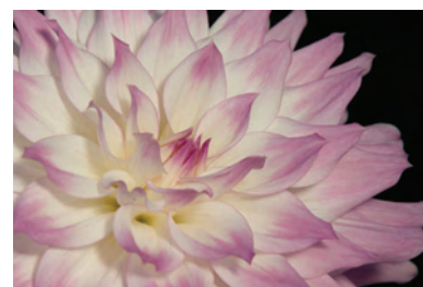
April Dawn B ID LtBld Wh/Pk 2008 Dahlia of the Year